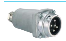
Male Inlet with Handle (Plug) 09-28017-185 + 09-2A913-67

A typical order should include an inlet part number, a receptacle part number AND the matching handles, angles or other required accessories.