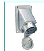
Female Receptacle with Angle Adapter 09-24017-185 + 09-2A027-185